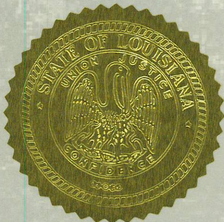
John Bel Edwards Governor

IN WITNESS WHEREOF, I have hereunto set my hand officially and caused to be affixed the Great Seal of the State of Louisiana, at the Capitol, in the City of Baton Rouge, on this 16th day of November A. D., 2023 .